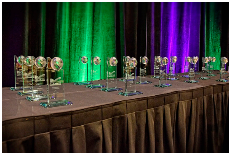
Valley Metro Clean Air Campaign Awards – MAG Livable Communities Winner